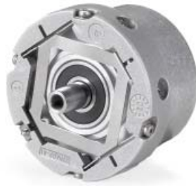
AEF/ECN/ERN 1300 series (plug-in PCB) and ECN/ERN 400 (cable connection) with expanding ring coupling (with high natural frequency of the stator coupling)

Encoders with EnDat interface (purely digital or with analog signals) offer the option of retrieving encoder parameters and predefined characteristic values of the motor and brake from an internal EEPROM. This can shorten commissioning times and prevent input errors when entering parameters of the drive system. In addition, EnDat encoders offer the possibility of electronic position adjustment (zeroing). Thus, the absolute position value of the encoder can be adjusted to the orientation of the motor rotating field, eliminating complicated mechanical alignment. Depending on the encoder, diagnostic functions such as temperature evaluation and valuation numbers are available for assessing the encoder's functional reserves. When critical values change, preventive measures can be taken in order to avoid unscheduled maintenance of the elevator.