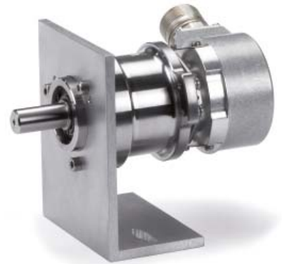
Bearing assembly with EQN 400 Shaft load up to: Axial 150 N Radial 350 N

An RIQ 400 or a bearing assembly with an EQN 400 is offered specifically for shaft resolution. The cabin position is often measured through toothed belts and deflection pulleys. The bearing assembly decouples the large forces that often occur here from the precision bearing of the rotary encoder, thereby preventing an overload on the encoder.