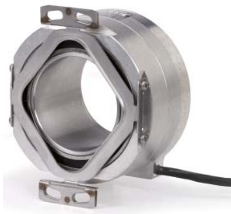
ECN/ERN 100 series Hollow shafts with inside diameters up to 50 mm