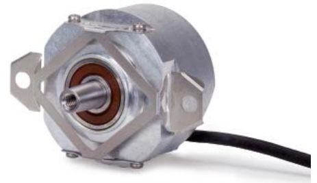
AEF/ECN/ERN 1300 series (plug-in PCB) and ECN/ERN 400 (cable connection) with plane-surface coupling (expanded running and mounting tolerances)