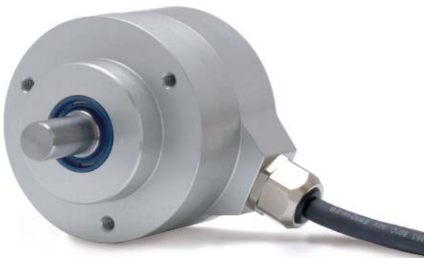
RIQ 400 series (clamping flange) Shaft load up to: Axial 100 N Radial 125 N