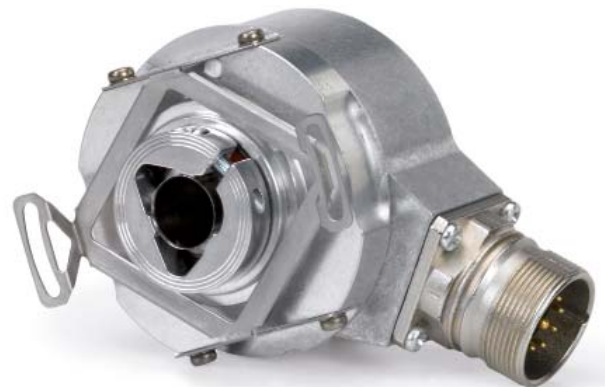
EQN 400 series