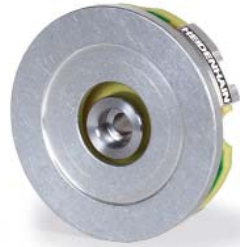
ECI/EBI 1100 series